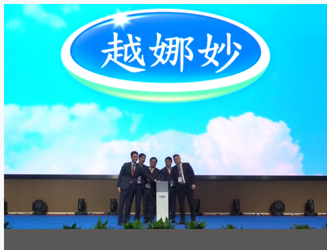
* Vinamilk launched with a localized logo and brand name, Yuenamiao to effectively target consumers in mainland China.