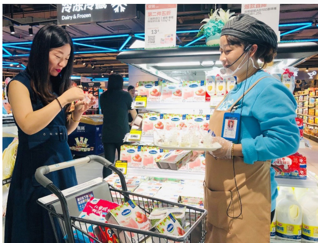
* Vinamilk, which is one of the world's 50 largest dairy companies, has been well-received in mainland China.

Like any brand deepening its presence in a new market, Vinamilk required local media outreach expertise as part of its Go-To-Market strategy. Securing a strong media presence was critical for the news of the launch to stand out given that the retail landscape in mainland China was already saturated with many well-established dairy brands.